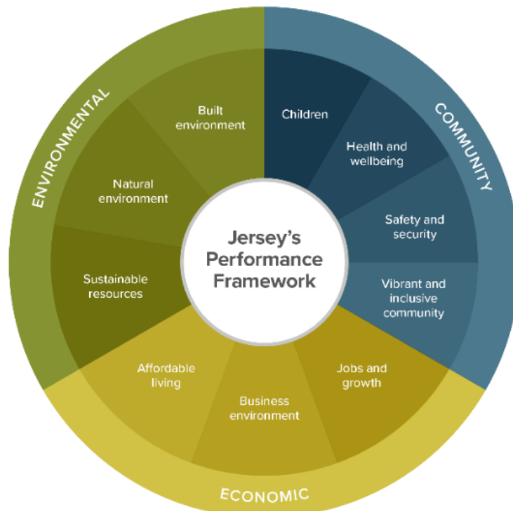
Figure PF3: Jersey's Performance Framework

The JPF sets out over 300 population and island-level indicators, across a range of sustainable wellbeing outcomes, which are summarised in the diagram below. Data on these indicators is updated regularly and published online 1 . These indicators are grouped into story boards for specific themes and are also closely aligned to the United Nations Sustainable Development Goals 2 and the OECD Better Life Index 3 .